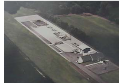
Aerial View of SHRWD's wastewater treatment plant

There is 73,000 feet of gravity line and 194,675 feet of force main line with ten lift stations and nine grinder pumps.